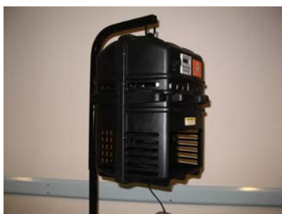
Figure 1a. MegaCatcha Premier MCP800

The study was limited, and should be expanded before the final decision on the traps is made. The results suggest however that the Mosquito Magnet Liberty Plus could be further developed for the purpose. However, this would require a modification of the catch bag. A major benefit of the Mosquito Magnet Liberty Plus, compared with many more traditional mosquito traps, is that it does not require access to dry ice (frozen CO 2 ), which in turn is difficult to provide in the field when dry ice requires cryopreservation at -80 °C. Dry ice also creates a risk of freeze damage, or poisoning by inhalation from leaking gas. The gas is heavier than air and therefore can accumulate in low-lying areas. If FM considers the use and storage of LPG cylinders in the field as a safety hazard the Mosquito Magnet Liberty Plus is discriminated as a mosquito trapping option. A summary of the performance of the both traps are presented in Table 1 and 2.