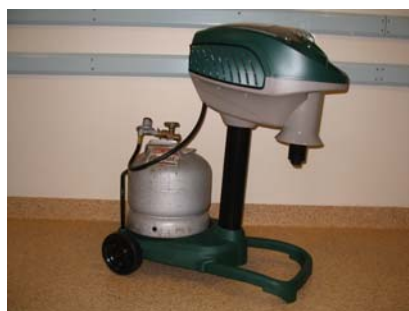
Figure 1b. Mosquito Magnet Liberty Plus